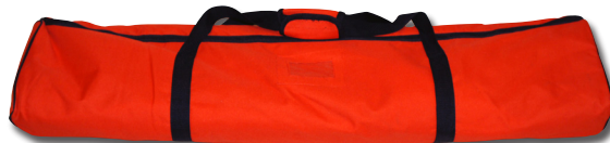
The V12 fits in a practical and easy to carry softbag.